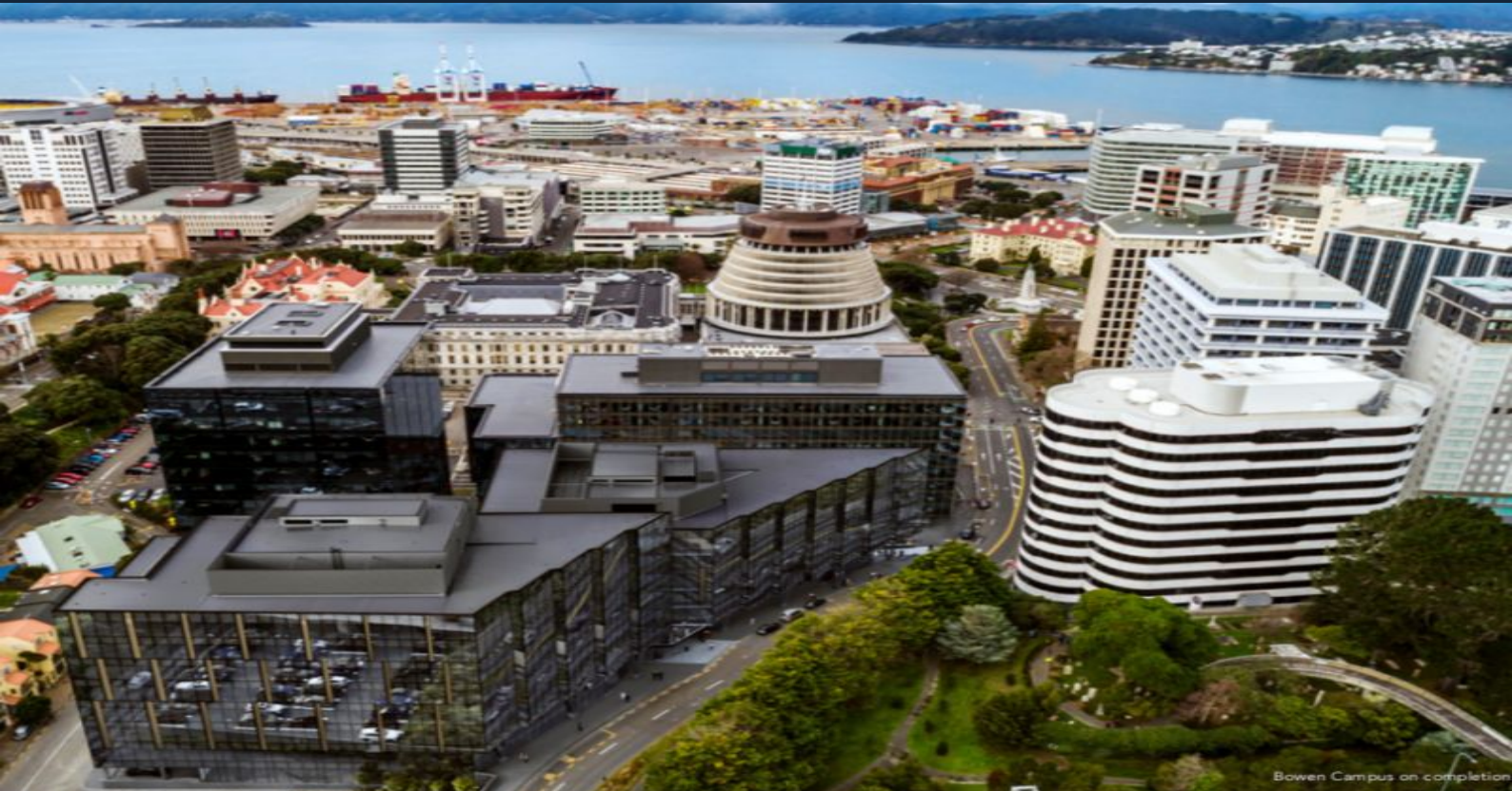
Bowen Campus on completion